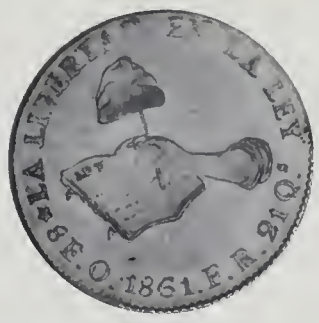
Lot No. 2417

8 Escudos, 1861 O-FR. Oaxaca. Similar to the type of Chihuahua. KM 383.10, Fr.74. The 8 Escudos struck in only ten separate years at this mint and all are scarce. Fairly well struck in the centers. Perhaps once lightly cleaned. Good Extremely Fine and scarce. (1,300–1,700)